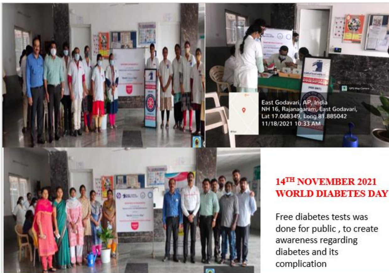
Fig 7 WORLD DIABETES DAY PROGRAM – NSS volunteers organized screening tests for 120 patients and assessed blood sugar levels.