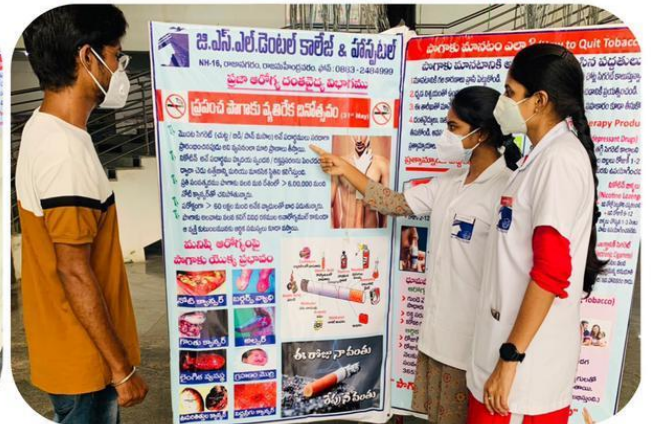
Fig:2 31 st May 2021 ANTI -TOBACCO DAY: NSS volunteers actively participated in antitobacco day in educating public regarding harmful effect of tobacco and its impact on human life.