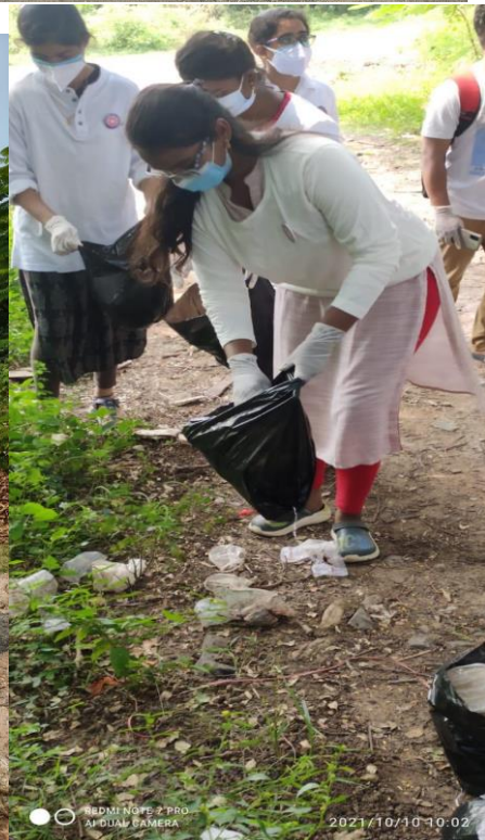
Fig 9: Oct 10 th -25 th 2021 clean India program : 60 NSS volunteers actively participated in program for 10 days in different areas of Rajahmundry and Kakinada.