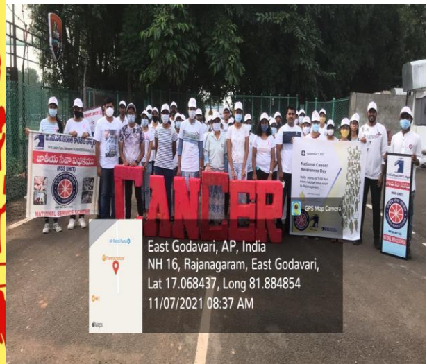
FIG 10 : 7 TH Nov 2021 cancer awareness rally in association Gsl cancer trust – 3km rally from college to rajanagram to educate public regarding early identification of precancerous conditions.