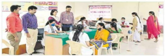
రాజానగరం గ్రేట్ ఫార్మసీ విద్యార్థులకు దంత పరీక్షలు చేస్తున్న వైద్య సిబ్బంది