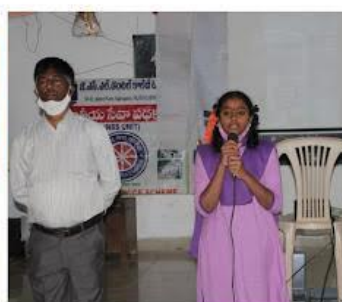
Fig 11: 24 th Jan 2022 National Girl Child Program – NSS Volunteers conducted an ART Competition on the theme “where do you see yourself in the future” and assessed their BMI Status in ZP High School, Rajanagaram . Our motto was to create a zeal as well as clarity about their future.