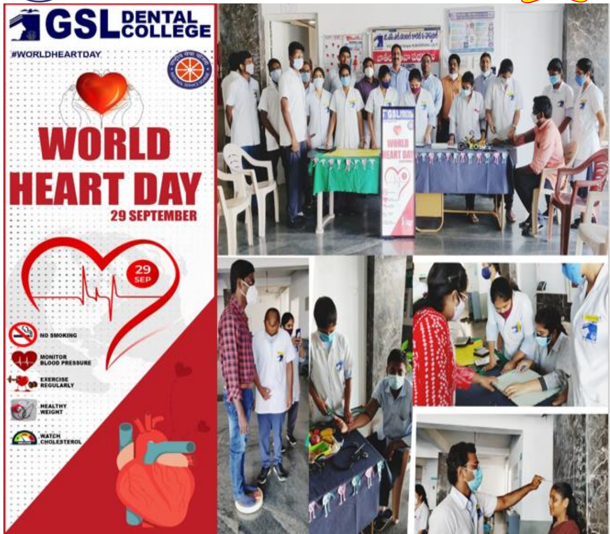
Fig 6: HEART DAY program – Healthy heart -Healthy life Screening was done for patients and assessed BMI and counseling done in order to prevent adverse effects.