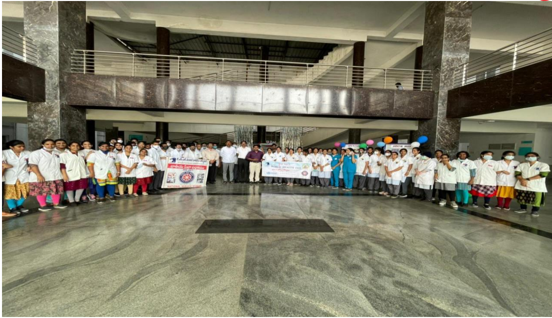
Fig ;1 (April 7 th , 2021) world health day celebration: Build a fairer, healthier world.